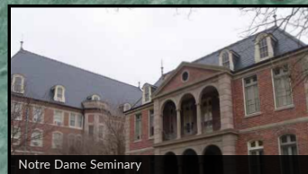
Notre Dame Seminary