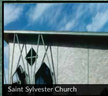
Saint Sylvester Church