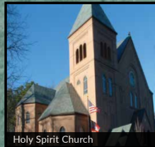
Holy Spirit Church